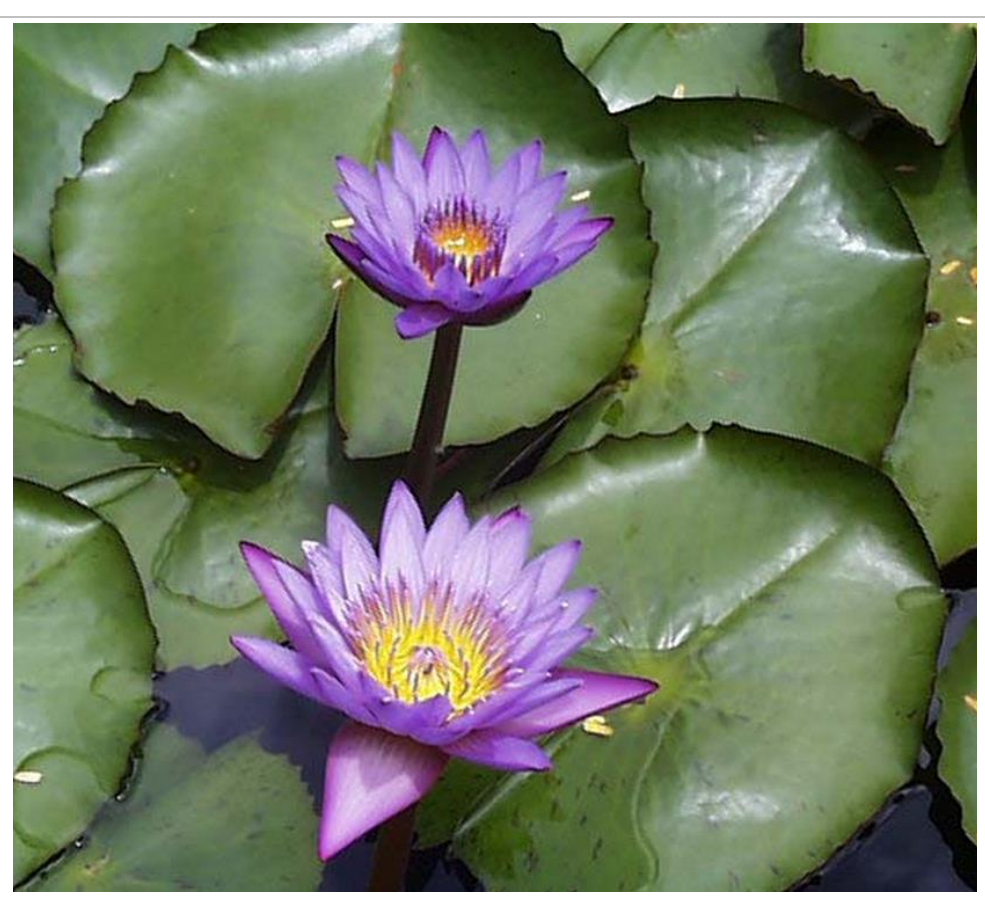
From the NIAS Lily Pond