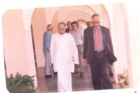
Shri C. Subramaniam Former Governor of Maharashtra & President of Bharatiya Vidya Bhavan during his visit on 3-3-95