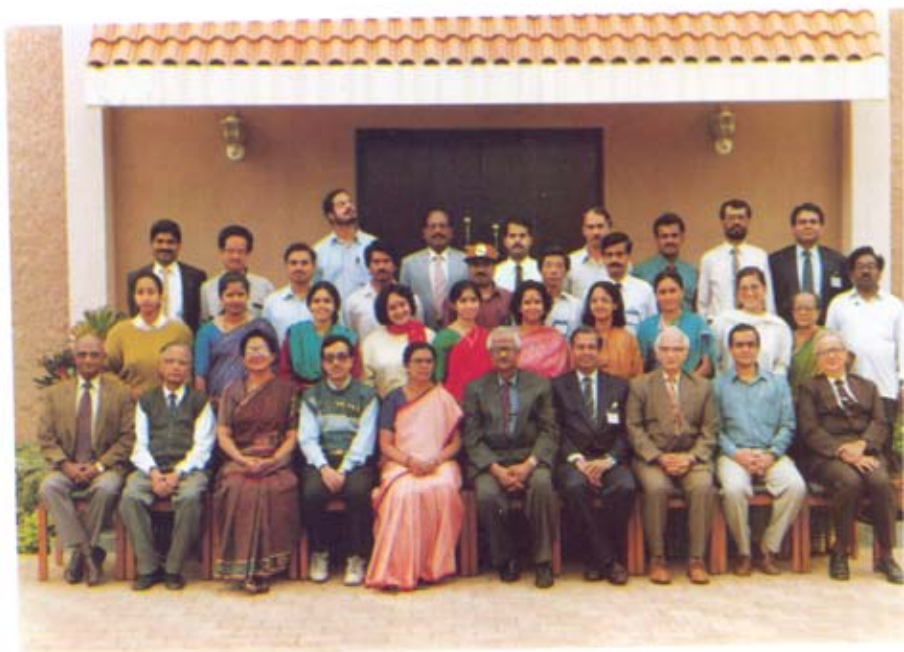
Participants of the Third UGC Course, July '95