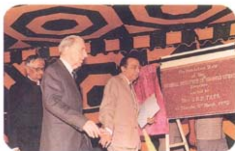
Late Mr. J.R.D. Tata unveiling the foundation-stone of the Institute