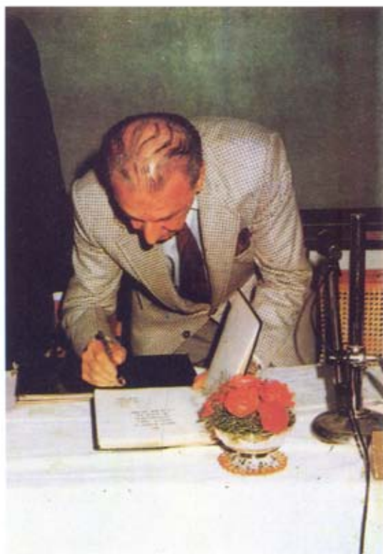
Late Shri J.R.D. Tata signing the Golden Book at the inaugural ceremony