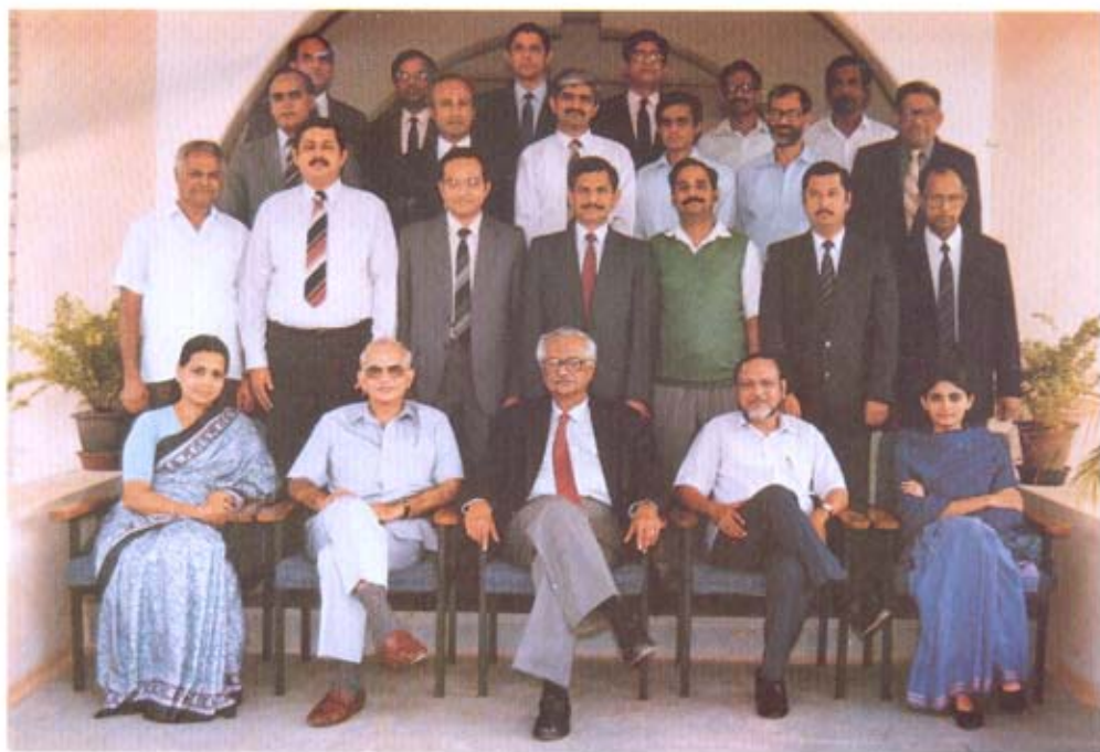
Participants of the Fifth NIAS Course Sept - Oct 1991