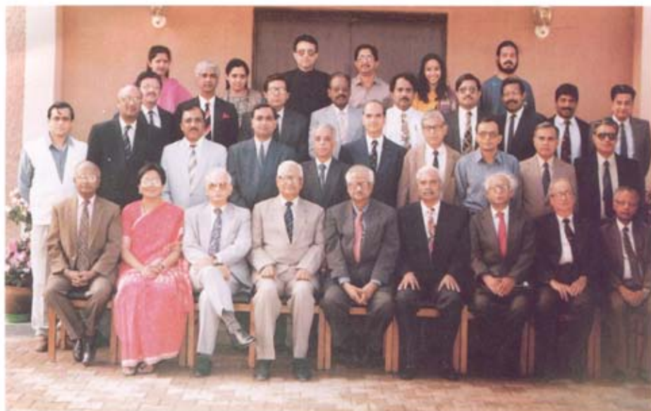
Participants of the Ninth NIAS Course, Jan - Feb '95