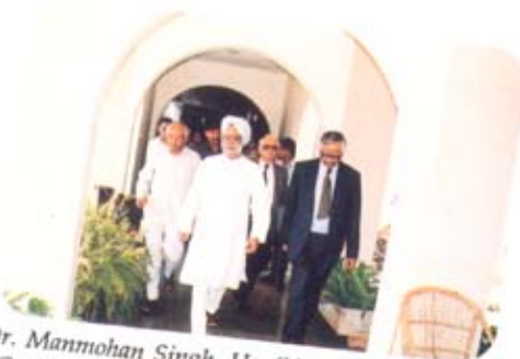
Dr. Manmohan Singh, Hon'ble Finance Minister Govt. of India, during the Inauguration of the Second UGC Course, 4-7-94