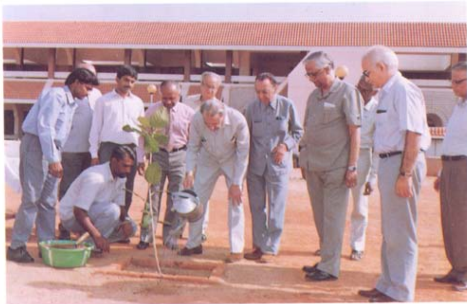
Mr. J. R. D. Tata, Chairman, NIAS planting a Banyan sapling in the campus on 19 March 19 When he visited the Institute to attend the Council of Management and Annual General Meeting