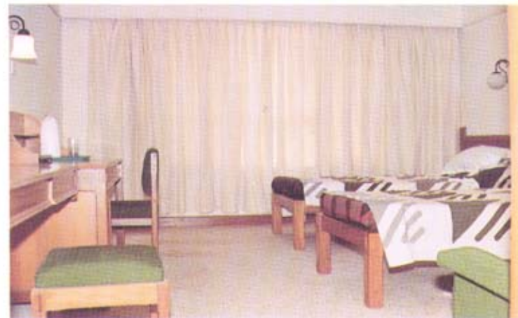
← Living room for the participants