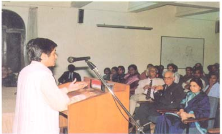
Ms. Kiran Bedi addressing the Associates of NIAS and Second UGC Course on 23-7-94 →