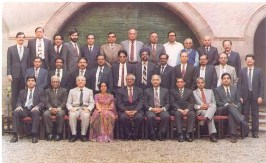
Participants of the First NIAS Course Jan - Feb 1989