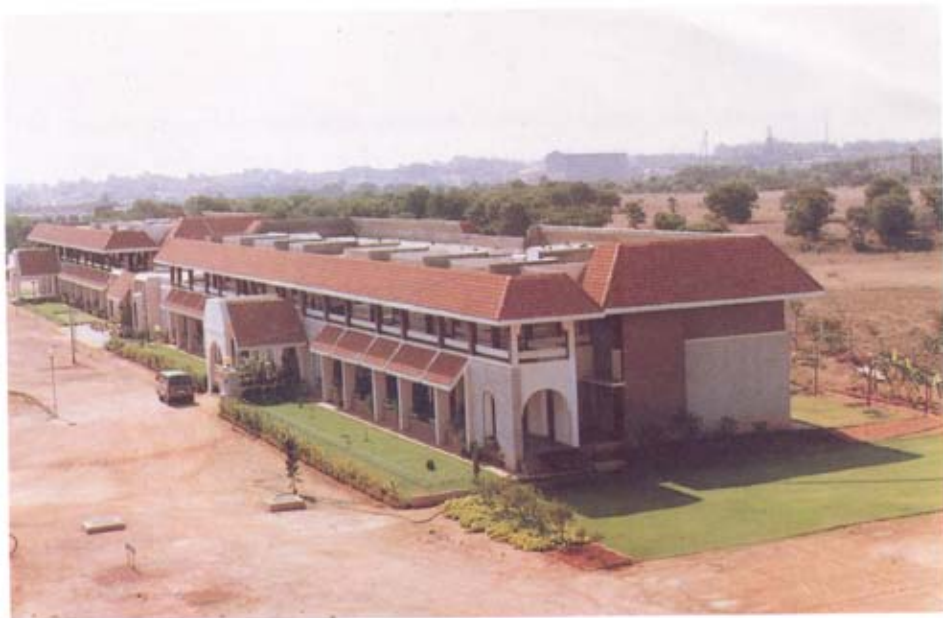
NIAS MAIN BUILDING