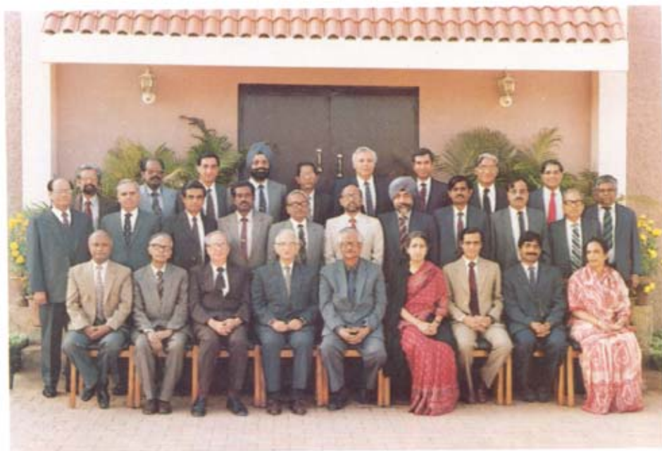
Participants of the Eighth NIAS Course, Jan - Feb '94