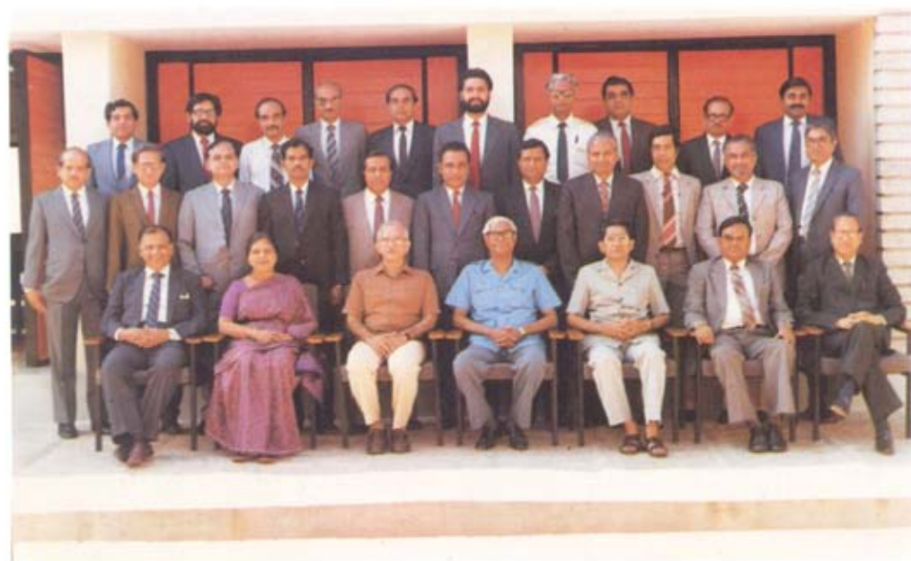
Participants of the Second NIAS Course Sept - Oct 1989