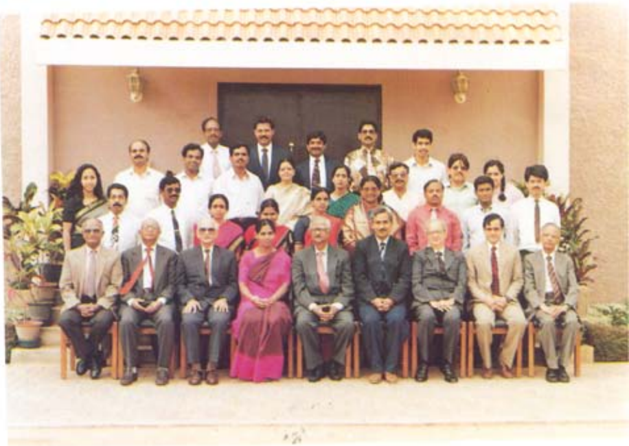
Participants of the Second UGC Course, July '94