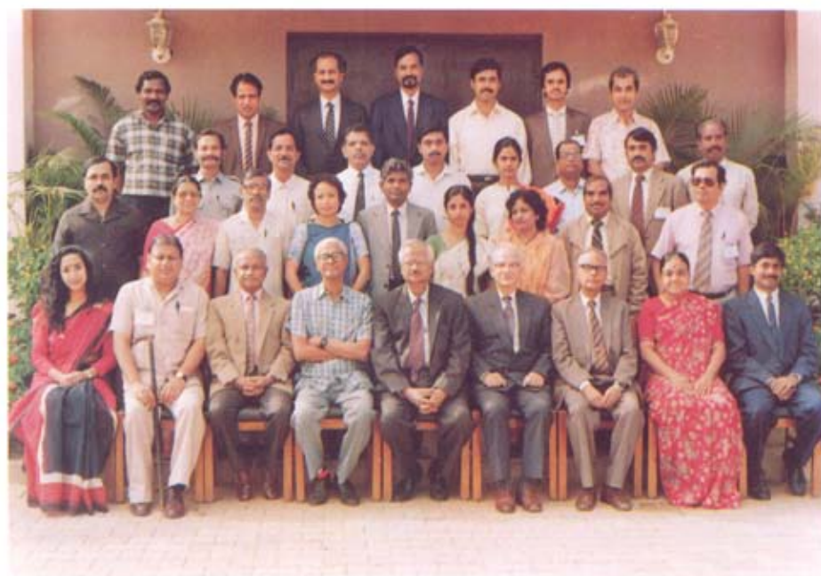
Participants of the First UGC Course, Oct. '93