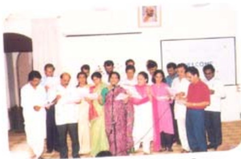
Participants of the Third UGC Course sharing their talents