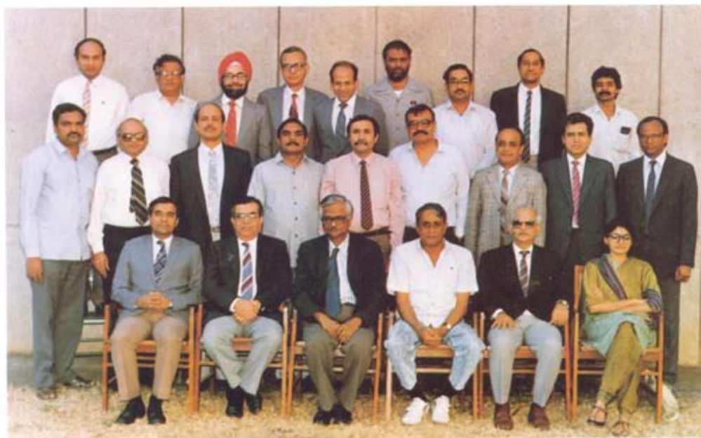
Participants of the Fourth NIAS Course Jan - Feb 1991