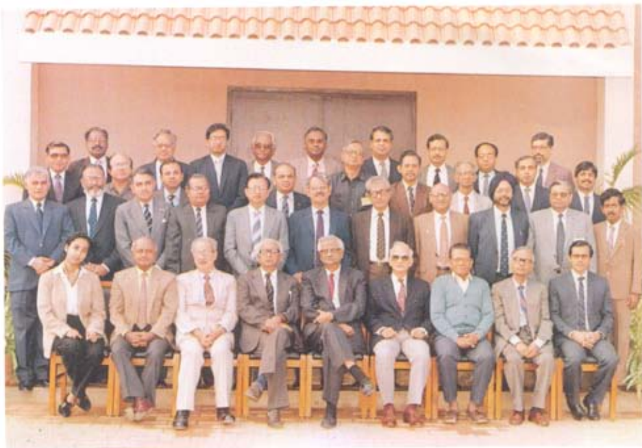
Participants of the Seventh NIAS Course Jan-Feb - 1993