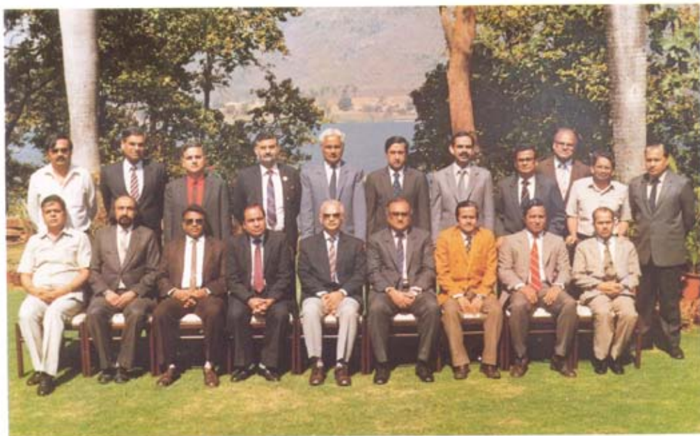
Participants of the Third NIAS Course Jan - Mar 1990