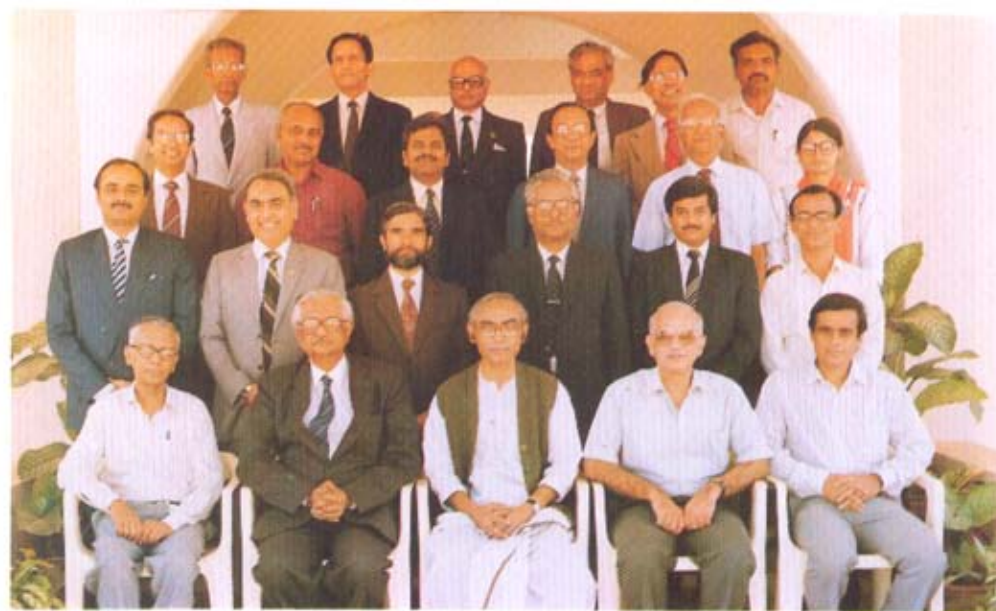
Participants of the Sixth NIAS Course Jan - Feb 1992