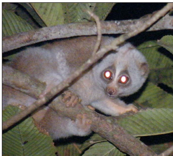
Figure 1. Bengal slow loris, Nycticebus bengalensis , in the state of Meghalaya, northeast India.

We obtained information on the presence of Bengal slow loris ( Nycticebus bengalensis ) through field surveys and secondary sources of information. Night transects were conducted along established human and animal trails, roads, streams, and rivers. In the case of paved roads passing through the forest, we used four-wheel-drive vehicles driven slowly (<5 km/hr), most especially in areas with high numbers of rogue elephant incidents. Once, we used a boat to survey forests along the river, as it provided the best access in that terrain.