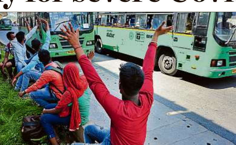
Migrant labourers wave to fellow workers being ferried to Chikkabanavara railway station from Kodigehalli in Bengaluru on Saturday