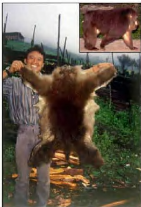
Figure 2. Skin of the Tibetan macaque M. thibetana discovered during this study being displayed. (Inset) Tibetan macaque from China with its characteristic dark and long pelage, pale white underside and stump-like tail.

identity of the skin was confirmed by its extremely short, stump-like tapering tail, with a relative length (ratio of the length of the tail to that of the head and body) of 0.135 (Table 1). The macaque was reported by the indigenous Tagin people of this region to have been killed in forests near Tak-sing, at an approximate altitude of 2200 m. They also confirmed the occurrence of troops of similar individuals in this area.