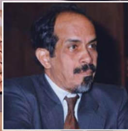
Prof Roddam Narasimha (1997-2004)