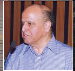
Dr K Kasturirangan (2004-2009)