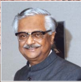
Dr Raja Ramanna (1987-1997)