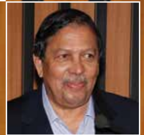
N Santosh Hegde